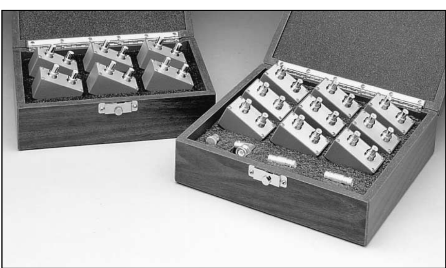
Model 5906: Calibration sources for Models 590/1M, 590/100k, 590/100k/1M, and 5904. Includes 1.5pF, 18pF, 180pF, 1.8nF, 18nF, 0.5pF, 4.7pF, 470pF, 4.7nF capacitance sources and 1.8µS, 18µS, 180µS, 1.8mS, 18mS conductance sources. Includes two storage cases.